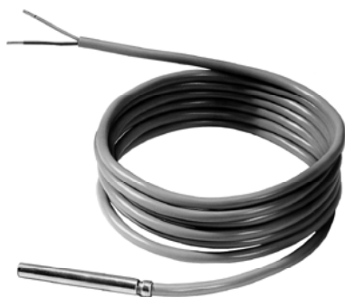
QAZ21.. and QAZ36..